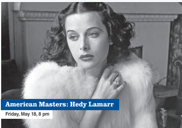
American Masters: Hedy Lamarr