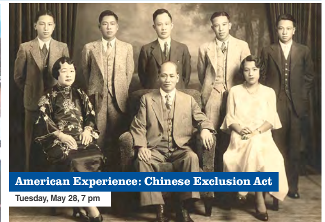
American Experience: Chinese Exclusion Act